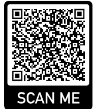
3. NCMP in Schools