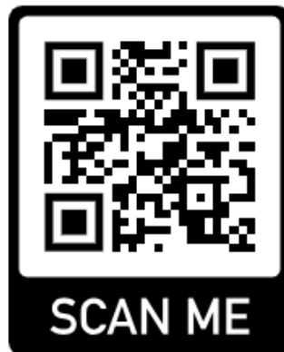
5. Recipes, articles and top tips to help you live healthy and happy