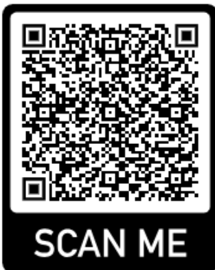
4. Guidance: how to talk to your child about weight